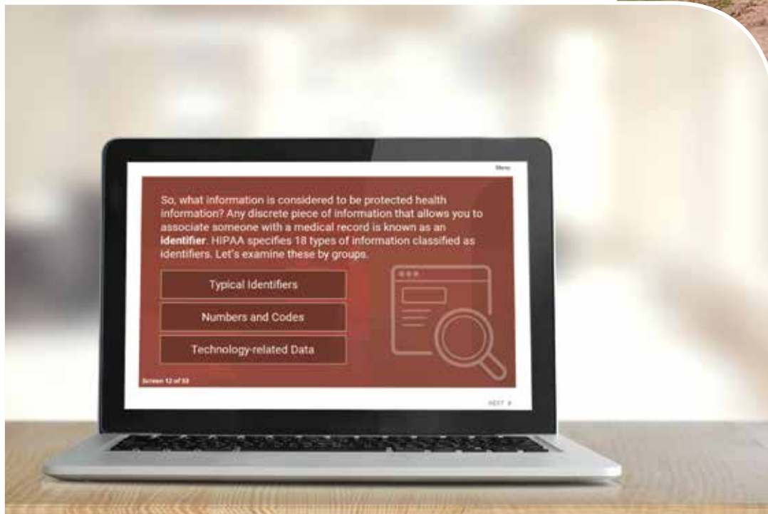
from HIPAA: Protecting Patient Privacy

Learners and administrators may visit portalhelp.ue.org to browse our catalog of self-help articles and access 24x7 live support.